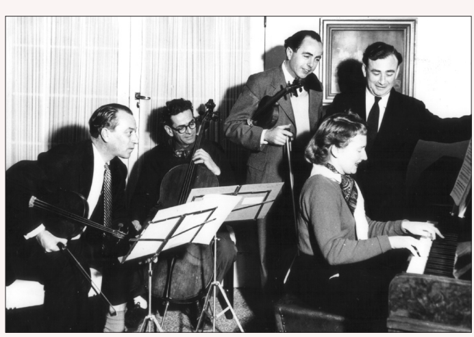
The Griller Quartet with Hephzibah Menuhin in 1953

Early in 1939 the Grillers visited the United States for the first time and the following season they returned, despite the outbreak of war: on 13 January they played Bloch's Quartet at Town Hall, New York. "Quite remarkable was the purity of tone maintained in every measure of the four movements, the unswerving fidelity to pitch and the suppleness of phrase everywhere present, even in the most complicated passages," Noel Straus wrote in The New York Times, although he felt the performance too restrained. Back in Britain, the Grillers were taken into the RAF as an ensemble and frequently appeared at Myra Hess's National Gallery Concerts, airing Bloch's Quartet several times in 1941 and 1942 and performing most of the great piano quintets with Myra Hess. On 17 May 1943