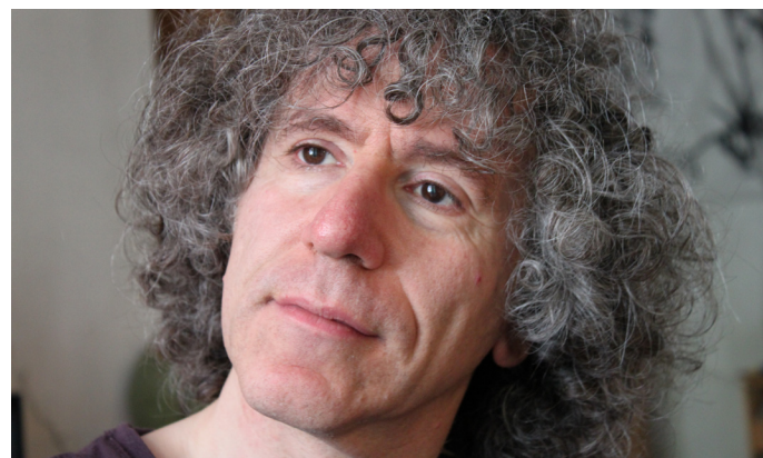
Steven Isserlis enjoys a distinguished career as a soloist, chamber musician and educator.